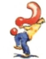
The Alpha Course.

For more details of these and other activities, please ring the church office on 01934 641574.